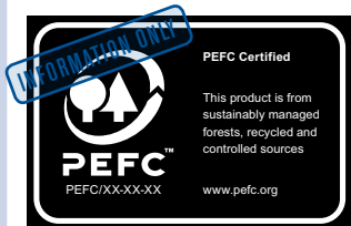
3. White on solid background